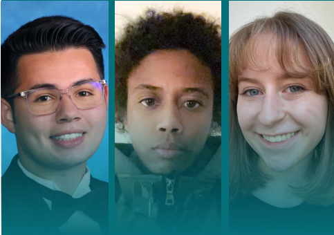
TECHNICAL COLLEGE WINNERS